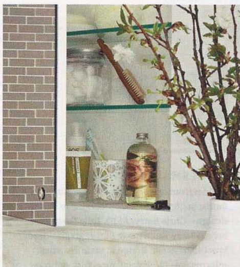
OPPOSITE: Open storage under the vanity makes the bath feel more spacious and offers a handy spot for towels. ABOVE LEFT: Flush-mount showerheads maintain a streamlined look in the shower; in-wall radiant heating keeps things cozy. ABOVE: The patterned wallcovering in the master bedroom inspired the bath's calming, neutral color palette. FAR LEFT: The sleek tub filler includes a built-in sprayer. LEFT: Recessed medicine cabinets boost storage at the vanity.