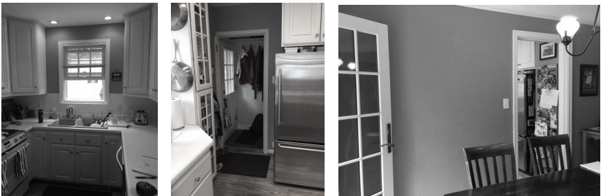
BEFORE: The kitchen was closed off from the dining room and cramped for storage.