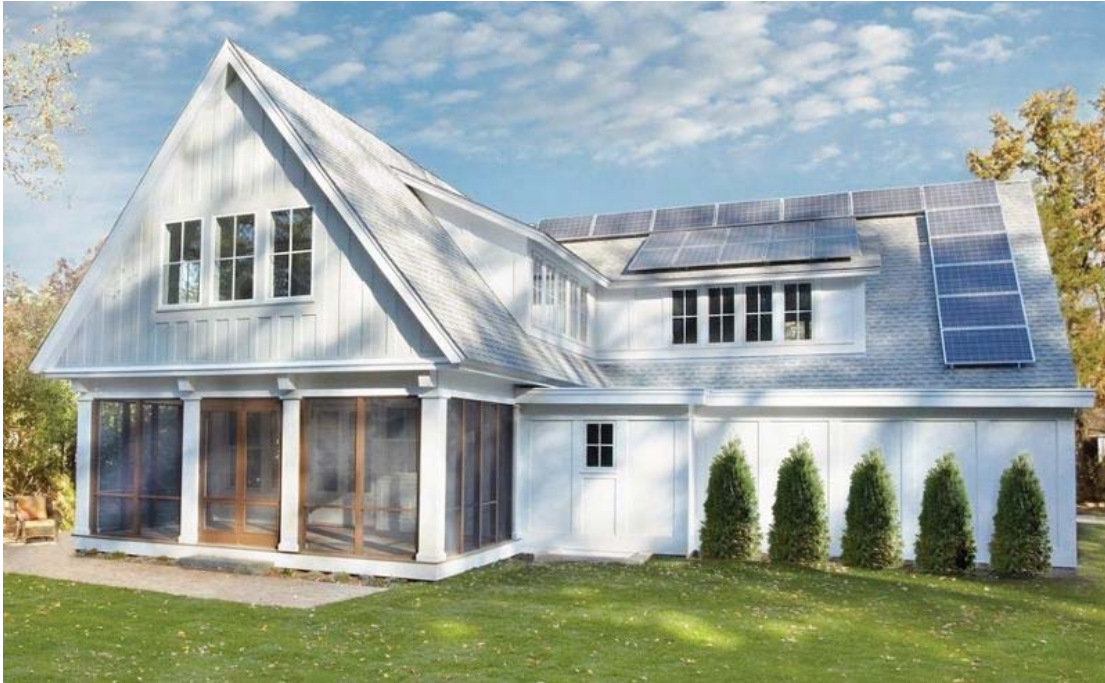
DiGiacomo Homes & Renovation, 2011 Green Dream Home, HERS Score: 39

information is the life-blood of markets and necessary in the making of smart personal choices. When preparing to build or purchase new, be sure to ask about the home's HERS score -- many builders use this rating system and it is recognized by most lenders and government agencies.